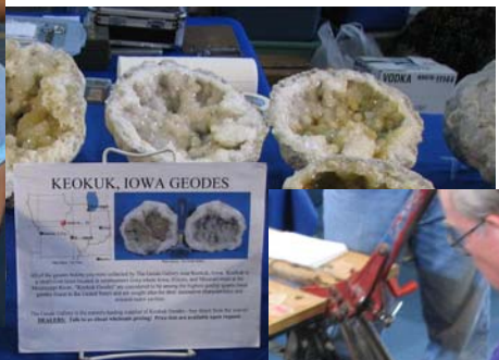
Many cracked open a Geode and were the first to see inside!