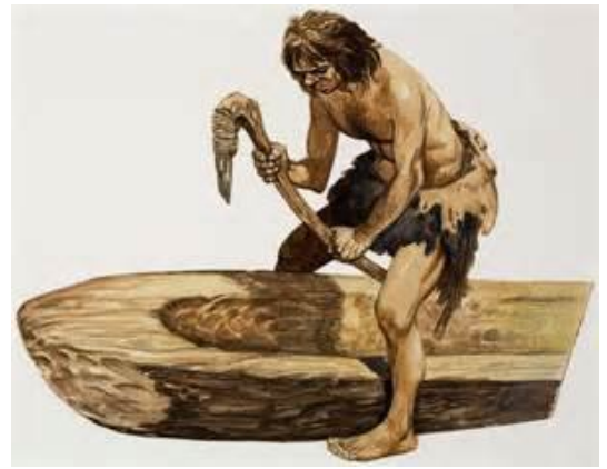
Stone Age man digging out a canoe.