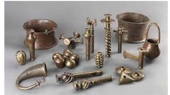
Copper age artifacts from the near-East.