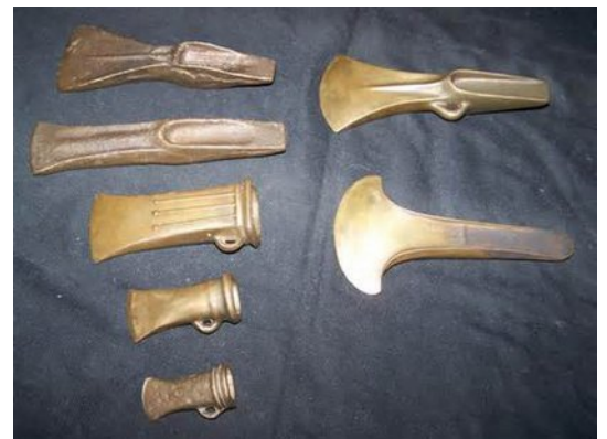
Bronze Age items from the Dover Museum.