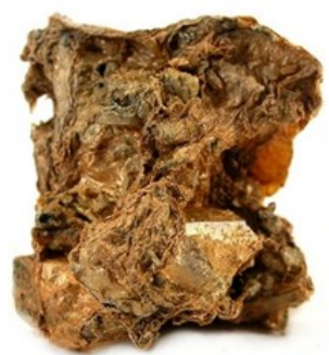
Rectorite from Pulaski County, Arkansas.

This was followed by the carbonate Rabbittite, the oxides Rancieite and Rauvite, and the phyllosilicate Rectorite, which almost looks like plant material (similar to mountain leather/Palygorskite).