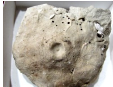
A Eucalyptocrinites crinoid calyx found in a Silurian-age Racine formation spoil heap in Cook County on the western edge of Chicago.

Pictured here is a nice Eucalyptocrinites crinoid calyx I found in a Racine Formation spoil pile in Cook County on the western edge of Chicago. The sedimentary rocks in this formation are from the Wenlockian Epoch, Silurian Period, approximately 430 million years ago. These are carbonate rocks formed when Illinois was submerged in an epicontinental tropical sea, not unlike the coral reefs of the Bahamas today. The fossils found in the Racine Formation are the remains of extinct reef animals preserved through deep time, long before dinosaurs or humans. Corals, crinoids, trilobites, cephalopods and brachiopods are some of the common creatures of the fauna.