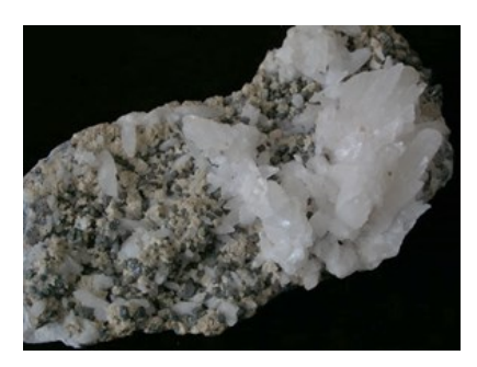
Calcite in daylight. Photo by Calvin Harris.

Shutter lag is the time between pressing the shutter button and when the photograph is made; it is characteristic of many digital cameras. In practice, the photograph is made by pressing the shutter release button and estimating the correct moment to discharge the flash unit. This trial-and-error approach requires many attempts to secure a photograph. However, success is possible with better understanding of digital cameras and some practice.