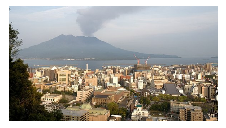
Kagoshima and its smoking landmark.

11. Sakurajima in Japan. It is actually within the city limits of Kagoshima, a city of 595,000.