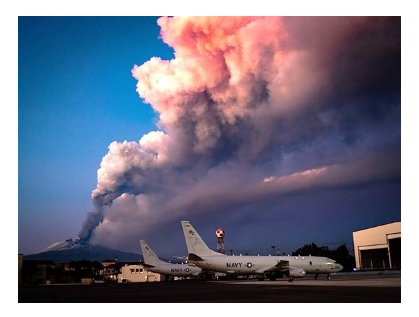
Mt. Etna erupts near the U.S. Naval Air Station at Sigonella in Italy.

Mt. Etna erupted recently with showers of rock and clouds of gas that briefly closed the airport in Catania, Italy. Etna is one of the Decade Volcanoes – also known as the Decade Sixteen – that are closely studied by scientists. They were identified in 1990 by the International Association of Volcanology and Chemistry of the Earth's Interior as part of the United Nations' International Decade for Natural Disaster Reduction, because these are volcanoes that are active, have a history of destructive eruptions, and are located close to populous areas.