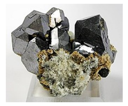
Galena (on quartz), the state mineral of Wisconsin.

New Club Officers: Even though this year went by without much club activity, there is always next year to look forward to. With that, clubs need to think about new officers for 2021, and nominating committees should start to think about who would want to continue their roles or who would be good candidates to step into the roles.