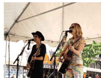
Photos from the 2019 Black Swamp Arts Festival

The Wood County Park District includes more than 1,100 acres of outdoor sights and activities, including the Black Swamp Preserve, which is in Bowling Green itself. The preserve is wheelchair- and bicycle-accessible, and has indoor restrooms. It has pollinator gardens, grass trails, and paved access to the Slippery Elm Trail, a 13-mile bike path.