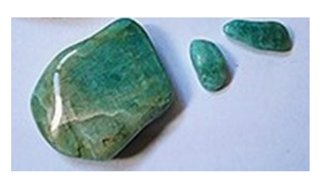
Photo of amazonite specimens by Mauro Cateb from Brazil, via Wikimedia Commons.

Amazonite is that stunningly beautiful and rare variety of feldspar, the most common mineral. Amazonite is in fact a type of microcline, which is part of the potassium feldspar group. Microcline can be from white to blue and from pink to green along with yellow. The green-blue variety is the most wanted color and was renamed amazonite. It is hard to know just where amazonite was first found since it dates back to ancient history, including the Egyptians' jewelry and burial purposes and the pre-Columbian days of South America and Central America.