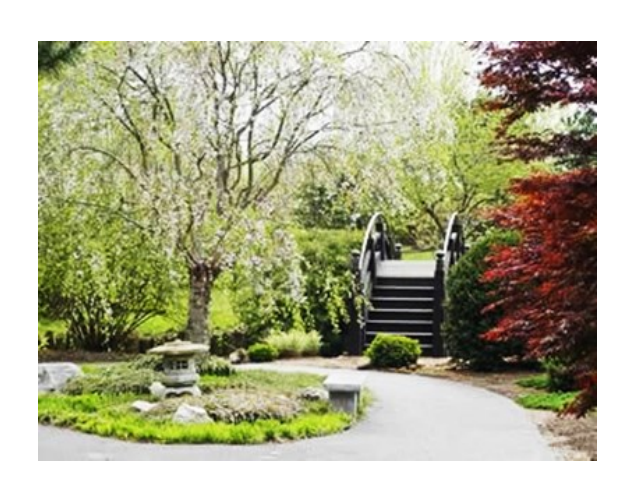
The Mizumoto Japanese Stroll Garden in Springfield, Missouri, site of the 2022 MWF convention.

He is looking for clubs to host the convention in 2024 and 2025. He noted that it is good for the clubs to have at least a year to plan for a convention. He reminded members that a club should not change their show to host a convention. The essentials needed are a meeting room – preferably at the show site, but it can be at a host hotel – a host hotel, and an awards banquet.