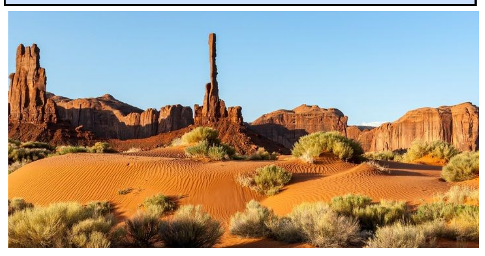
Totem Pole Rock, one of the features of Monument Valley Navajo Tribal Park in Arizona.