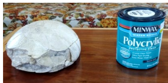
Fossil turtle sealed with Minwax Polycrylic.

Lynn Borysenko from Ainsworth, Nebraska recommended a product for preserving fossils. A MINWAX water-based protective finish, Polycrylic, provides a crystal clear finish, is fast-drying, and is easily cleaned with soap and water. Use the clear satin finish for a natural appearance. Besides the obvious advantages, it provides a rock-hard (excuse the pun) finish and is dissolved by acetone.