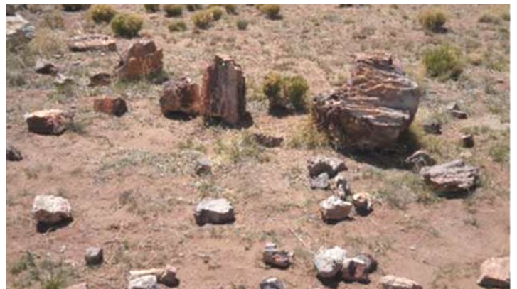
Photo of petrified wood at Dobell Ranch