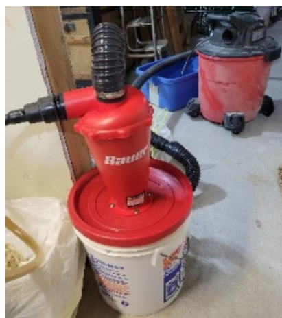
Inline setup.

Harbor Freight has the Bauer cyclone dust separator kit for a 5-gallon bucket for a cost around $40. Add a 5-gallon bucket and a length of soft Tygon 1-inch tubing to reach the bottom back of the saw, and you have a mean cleaning machine. On the suction Tygon tubing, a screen should be added to prevent chunks from plugging the hose. Start the vacuuming with the heavy sludge first, then the "cleaner oil" to flush the tubing of the heavy sludge.