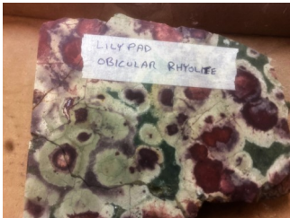
Lily Pad Rhyolite