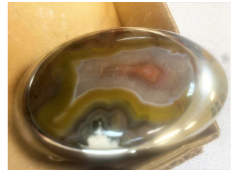
Agate Belt Buckle