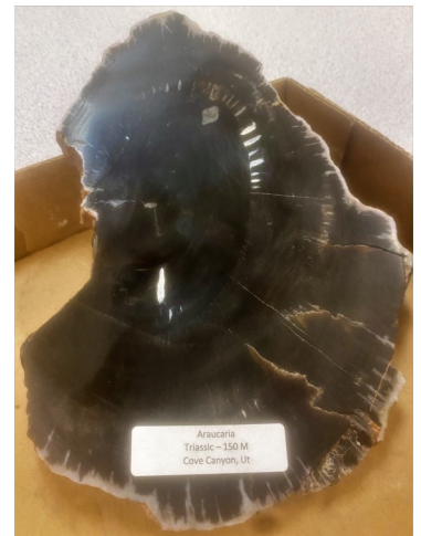
Araucara Pet Wood