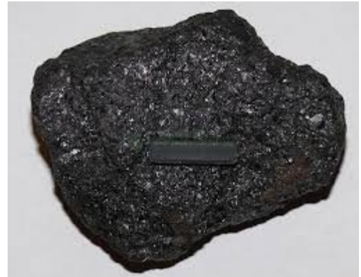
Bar magnet stuck on Magnetite chunk