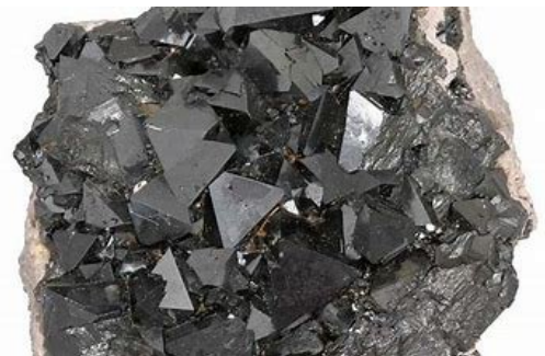
Close-up of Magnetite crystals