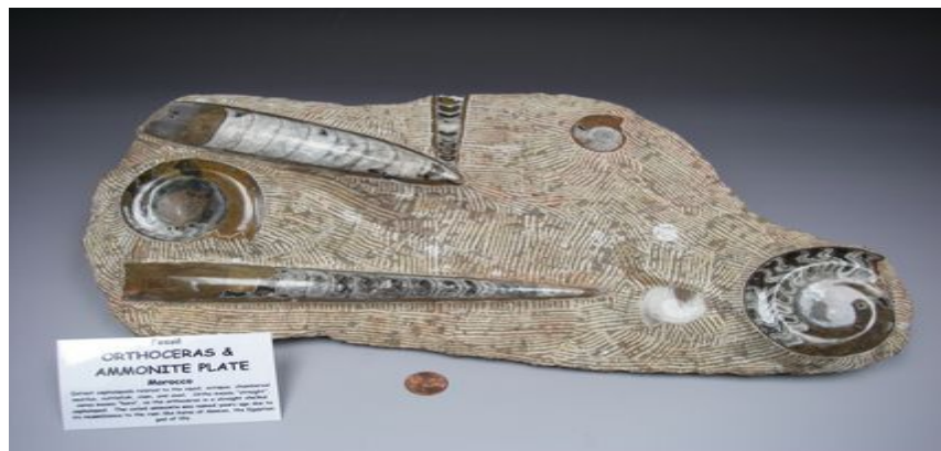
This Orthoceras plate will be auctioned off April 29.

Remember: The Banquet starts at 6pm. Bring plenty of food, and supply table service (plates, silverware, etc.) for your party.