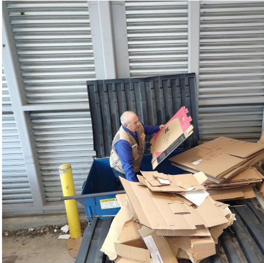
Rockhounds are relentless in their search!

White Lake Community Library 3900 White Lake Drive Whitehall, Michigan