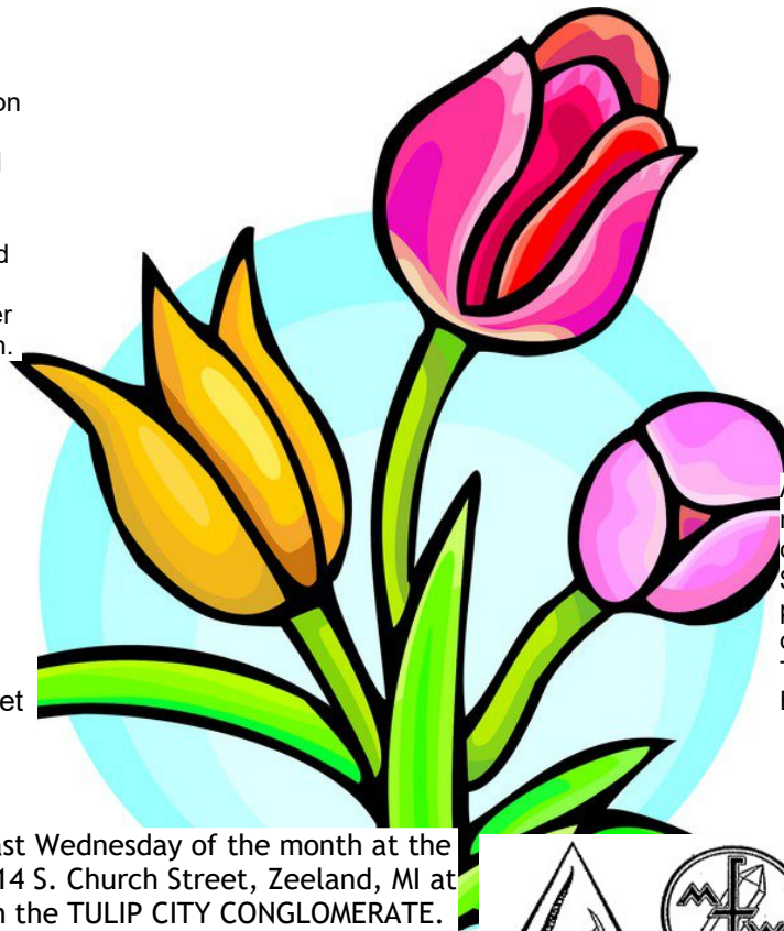
Spring clip art from the internet

The deadline for submissions is 5p the Thursday after the Board Meeting.