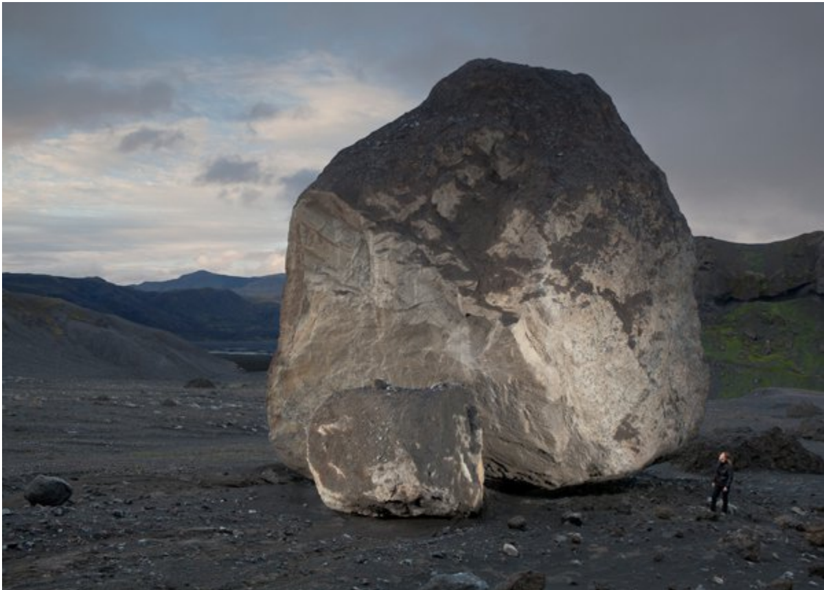
A Huldufolk rock in Iceland?

Last month, the December Board Minutes were published. That was actually a draft version. The corrected/approved minutes are above.