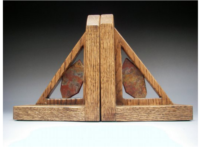
The last pair TCGMC has of beautifully handcrafted book ends, made by Jan Maher. 6" X 4 3/4" X 3 3/4" Oak and Crazy Lace Agate