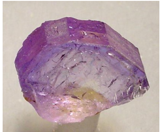
Apatite (CaF) (from wikipediacommons)