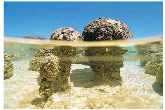
Shark Bay, Australia, Stromatolites

For 2017, there are fifteen (15) positions, which have one vote each. There are currently (16) persons on the Board (two persons share one position).