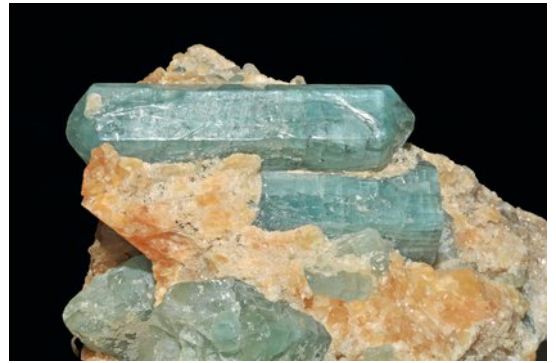
From Calvin.edu Chimes Oct 28, 2016

"Apatite" = Calcium Phosphates a basic unit of Ca(PO_4) attaches end elements of Chlorine (Cl) or Fluorine (F) or hydroxyl (OH)