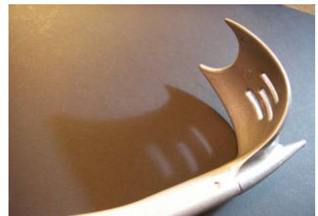
The Treasure Scoop!