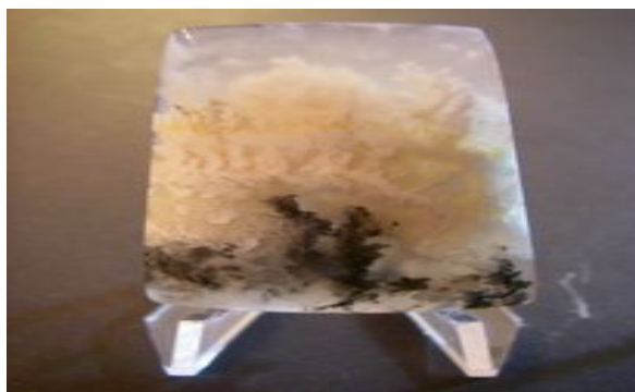
Stinking Water Plume Agate cabochon.

For the TCGMC Monthly Raffle, tickets cost $1.00 or 6/$5.00. All funds raised from this raffle will be assigned to the Gibson Fund which grants money to GVSU Geology students for studies out of state.