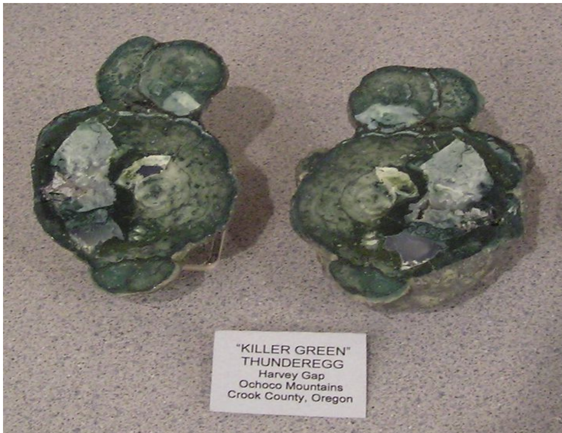
Wearing O' the Killer Green

ALAA is the lobbying arm of the American Federation, working on behalf of rockhounds to keep public lands open and accessible to all, including the elderly and handicapped.