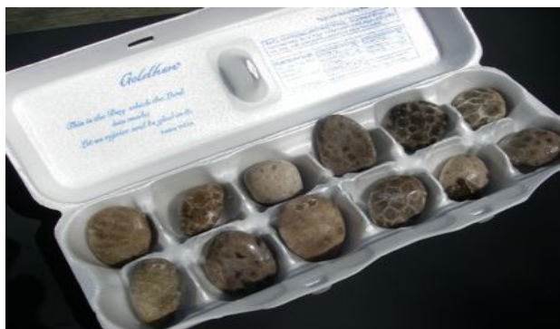
Petoskey stones. Grade AA.