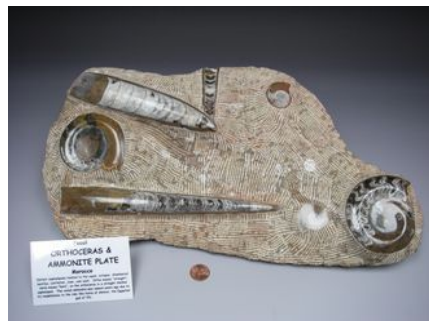
The Orthoceras plate that will be auctoined off at the April banquet.