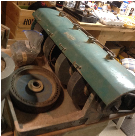
Star Diamond wheel grinding unit with two new wheels