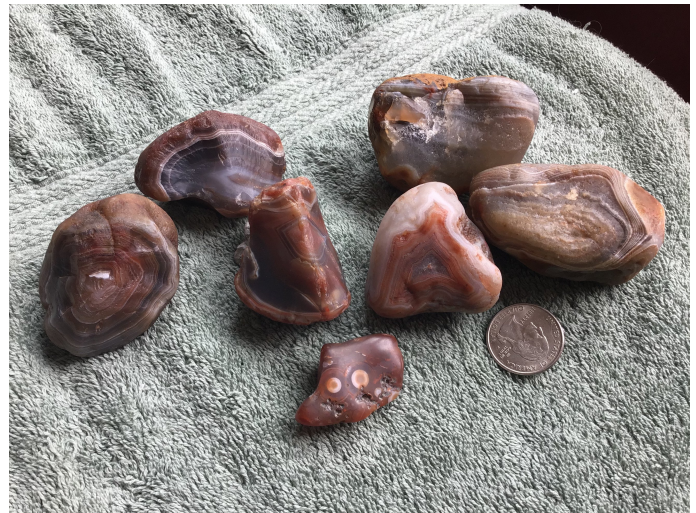
Seven Lake Superior Agates including an eye agate