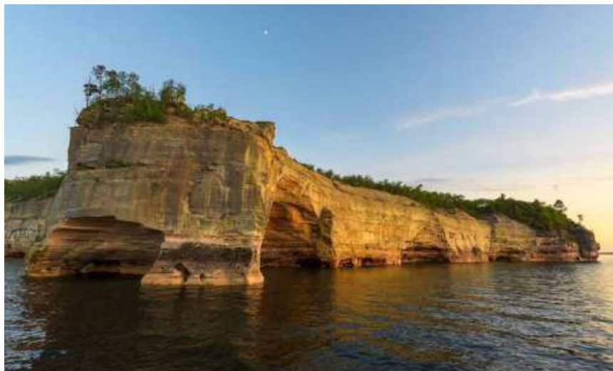
Please be informed that the Pictured Rocks will NOT be auctioned.