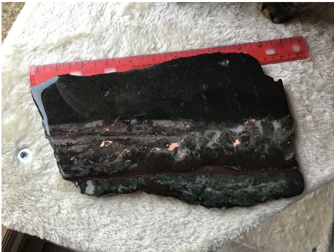
Copper/Prehnite/Quartz slab measuring 10" by 6". This picture is dark, it is a very lovely display piece.