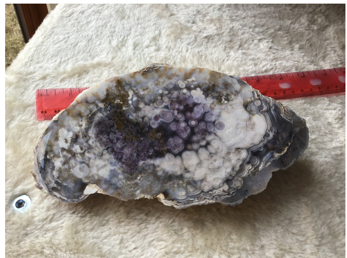
Luna agate measures 8" by 4". Beautiful piece with purple circles in the middle.