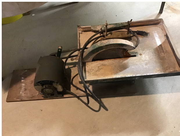
Covington 10" Trim Saw