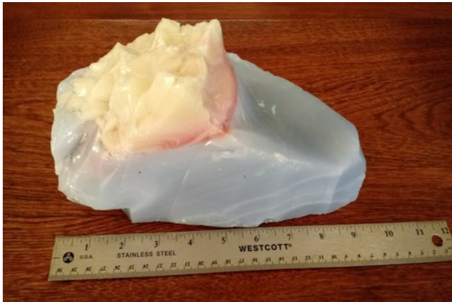
Glass slag chunk!

Again, in explanation for the benefit of new members, this is a meeting feature that we have most months but not always. Several items are offered as raffle items from a batch that have been donated “for the cause” over time. These pictured items will be raffled in November, with the drawing after the refreshment break. The money collected tonight, and in December, will be allocated to a “Speaker Fund” to bring the Club someone special to speak at the April 2018 Scholarship Banquet. The April meeting is traditionally a Potluck Banquet where we award Geology majors from Hope College and Grand Valley State University a budgeted amount. Awardees are chosen by their own faculty. These Scholarships are a major beneficiary of our annual Show proceeds. Tickets for the raffle are $1 each or 6 for $5.