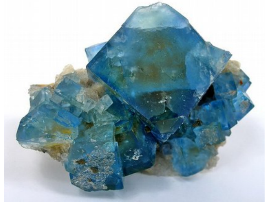
Blue!