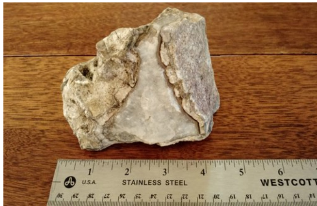
"Big Diggins" Agate, Deming, NM