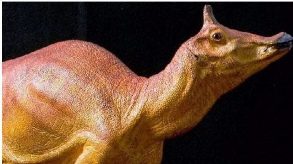
Augustynolophus morrisoni, California's new State Dinosaur, a member of the Hadrosauridae family. (from the ALAA Newsletter Vol 9 Issue 4