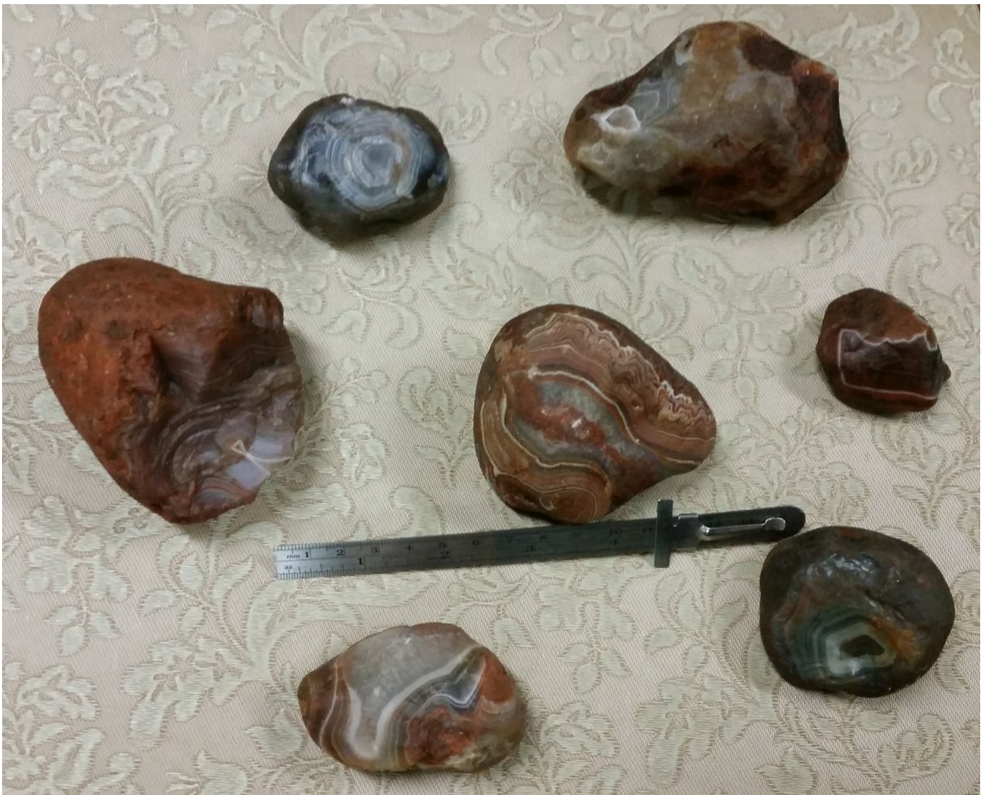
These agates will be auctioned at our November meeting.