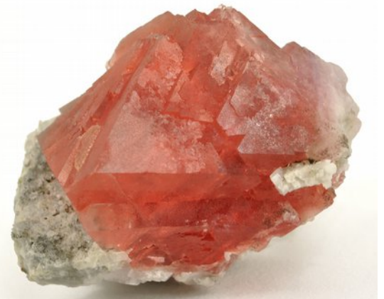
Orange-pink? Salmon? (from wikipedia)